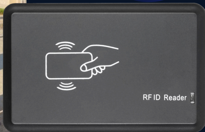
Contact Card Reader